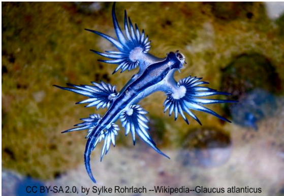
Glaucus atlanticus

The blue sea slug or Glaucus Atlanticus, also commonly known as blue glaucus, sea swallow, or blue dragon lives in the water off the coast of Europe, South Africa, Mozambique, and east Australia.