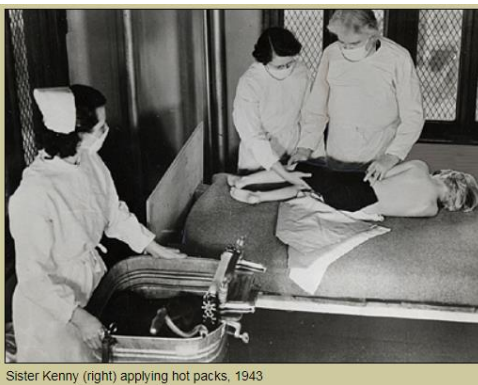
Sister Kenny (right) applying hot packs, 1943

Paralytic Poliomyelitis – "Elizabeth Kenny, or Sister Kenny, as nurses were called in Australia, came to the United States in 1940. Her methods of hot-pack applications [a moist piece of wool cloth], stretching, and muscle massage were unconventional and controversial, but eventually became part of standard care for polio." 2