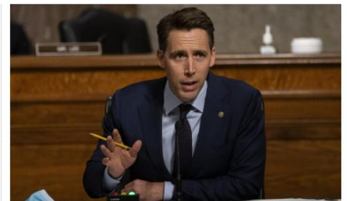
Sen. Josh Hawley (R-Mo.), on Capitol Hill in Washington on Aug. 5, 2020.

MAKE A DONATION THE EPOCH TIMES IS POLITICS CHINA WORLD OPINION BUSINESS SCIENCE LIFE MIND & BODY ARTS ENTERTAINMENT VIDEO