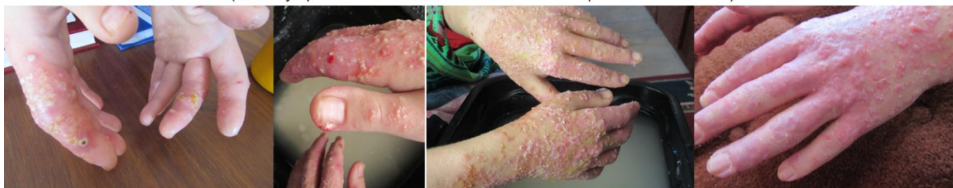
After a 10 day repeated, though relatively short (1 hour a day) accidental exposure