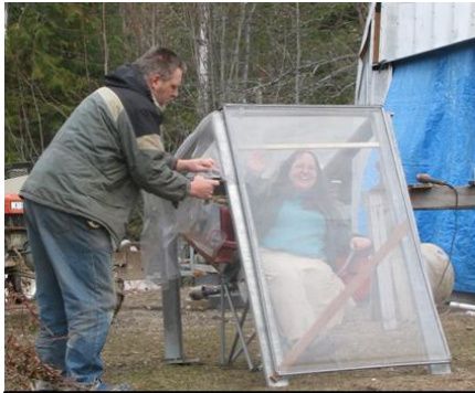
Improvising a "sun-chamber"

Recently, when the signals from a mountaintop tower began trespassing into our off-grid lawn and garden area, we had to come up with a different way for me to be able to get the necessary sunshine and to work. My husband fashioned a makeshift aluminum-screened tent to block the EMFs (at least those from 3G and 4G) and still allow sunshine through, at least until we can build something more permanent. Besides gathering my sunshine in a different way, I also must gear up in an EMF-blocking poncho for work. I can only assume that God has allowed us to see these problems from the side of the patient so that we can help to raise awareness in order to lessen the sufferings of others as 5G and Starlink in the sky leave no place to hide.