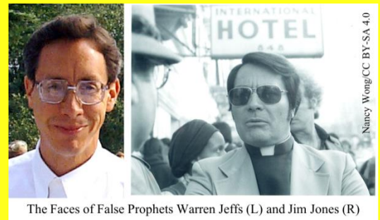
The Faces of False Prophets Warren Jeffs (L) and Jim Jones (R)

"Jim Jones ....American cult leader who promised his followers a utopia in the jungles of South America after proclaiming himself messiah of the Peoples Temple, a San Francisco-based evangelist group. He ultimately led his followers into a mass suicide [Kool-Aid laced with cyanide], which left more than 900 dead and came to be known as the Jonestown Massacre (November 18, 1978) —adopted the name 'the Prophet.' " https://www.britannica.com/biography/Jim-Jones