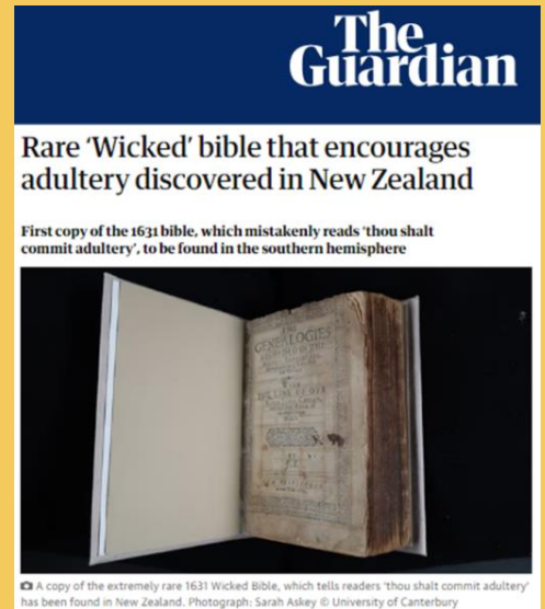
1 A copy of the extremely rare 1631 Wicked Bible, which tells readers 'thou shalt commit adultery' has been found in New Zealand.

Some of the seed "fell by the way side; and it was trodden down, and the fowls of the air devoured it." Luke 8:5 Jesus interpreted, "Those by the way side are they that hear; then cometh the devil, and taketh away the word out of their hearts, lest they should believe and be saved." Luke 8:12 Here we find those whose heart is "hardened through the deceitfulness of sin." Hebrews 3:13 The hearers do not discern that the gospel message applies to them. Before the gospel message can sink in, its ability to sprout is trodden down or devoured by the devil and his hypocritical, fanatical, or unkind human agents. Sometimes this is caused by conflict with supposed "Christians" or even doubts coming from higher criticism in a pastor as described in Jeremiah 12:10, "Many pastors have destroyed my vineyard, they have trodden my portion under foot, they have made my pleasant portion a desolate wilderness." In order to avoid this pitfall, remember man is small, and God is big. Don't let a little person or their finite opinions obscure your view of Jesus. Consider, if you let a hypocrite come between you and God, he is closer to God than you are.